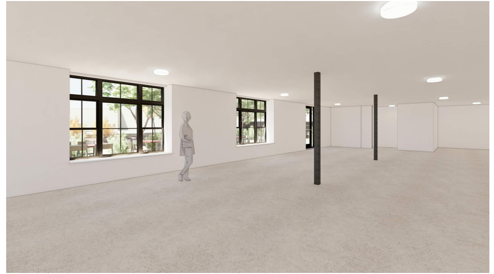
CONCEPT VIEW FROM TENANT SPACE