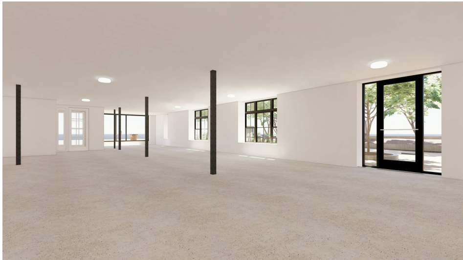
CONCEPT VIEW FROM TENANT SPACE