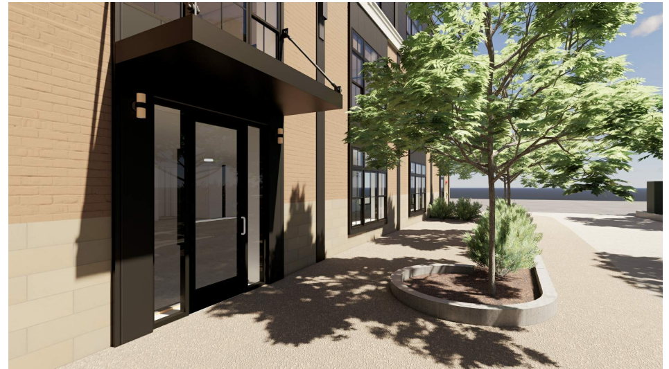
CONCEPT VIEW FROM TENANT SPACEY