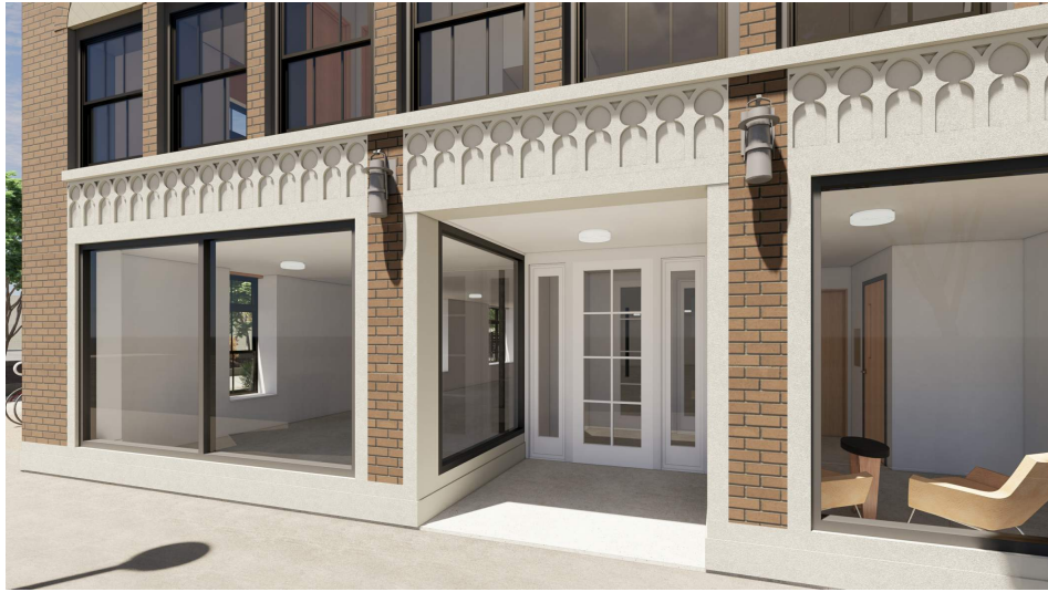
CONCEPT VIEW OF ATWOOD ENTRY